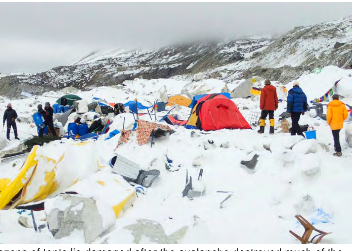
Dozens of tents lie damaged after the avalanche destroyed much of the base camp.