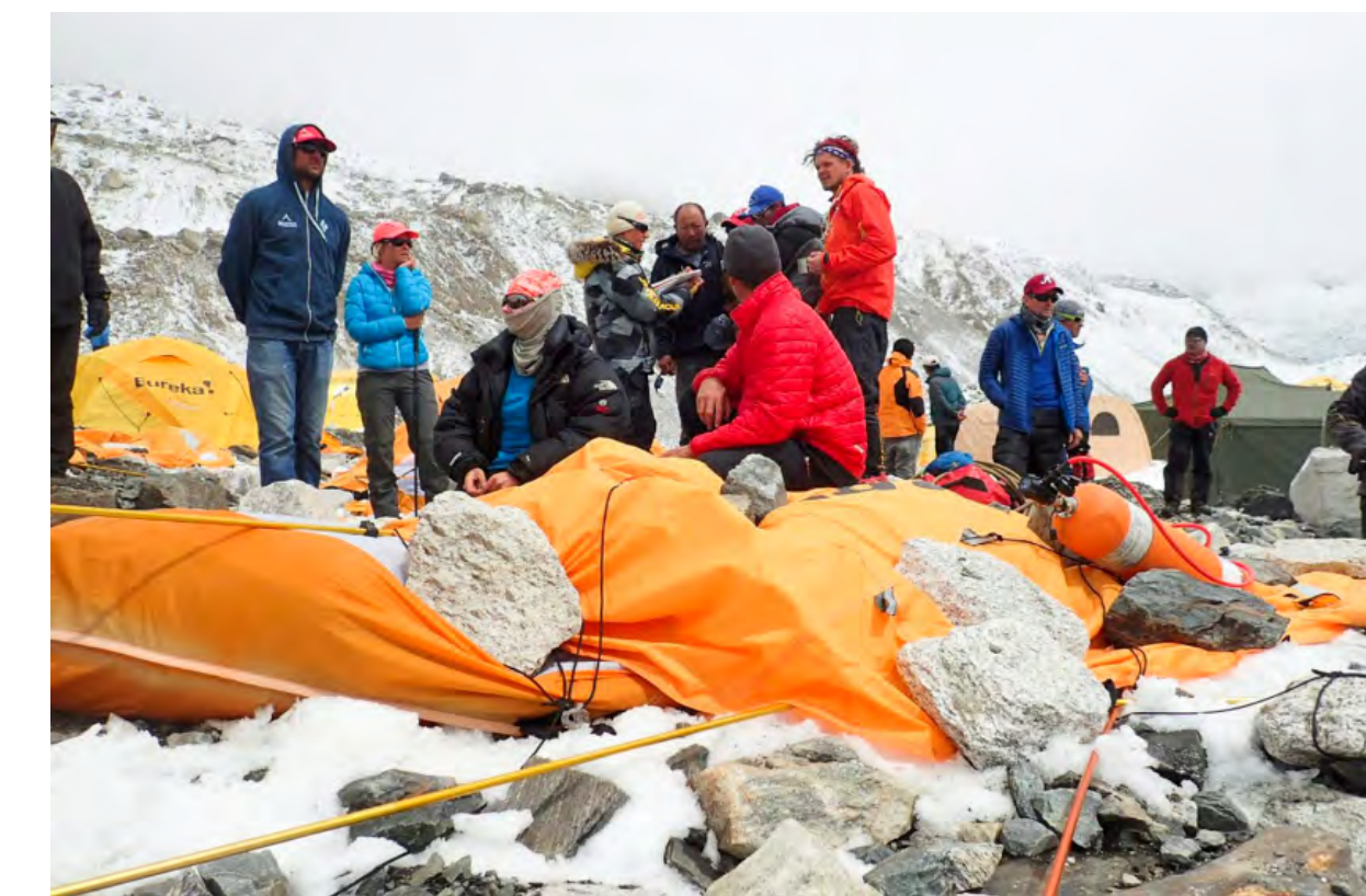
Three New Yorkers miraculously lived through the deadly Mount Everest avalanches triggered by Nepal's devastating earthquake, and they told their amazing tales of survival — and flat-out luck — on Monday.