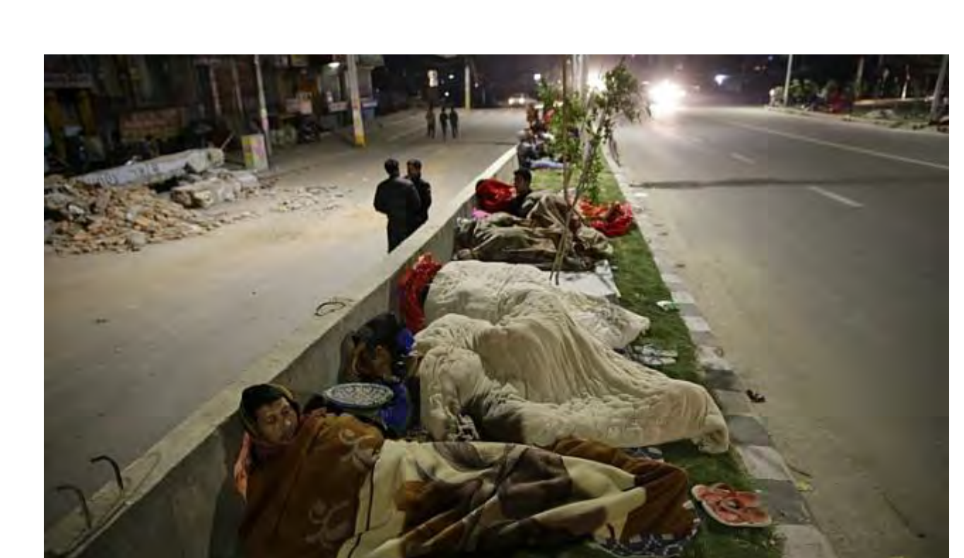
People sleep outside on a street a in Kathmandu, Nepal, following the massive earthquake.