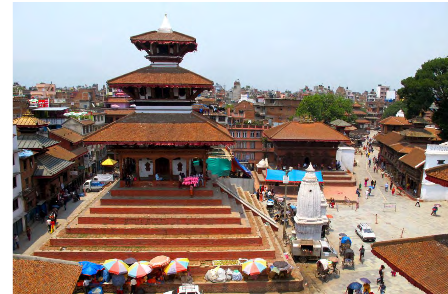
Maju Deval, Katmandu, before. This temple, built in 1690, is a Unesco World Heritage site.