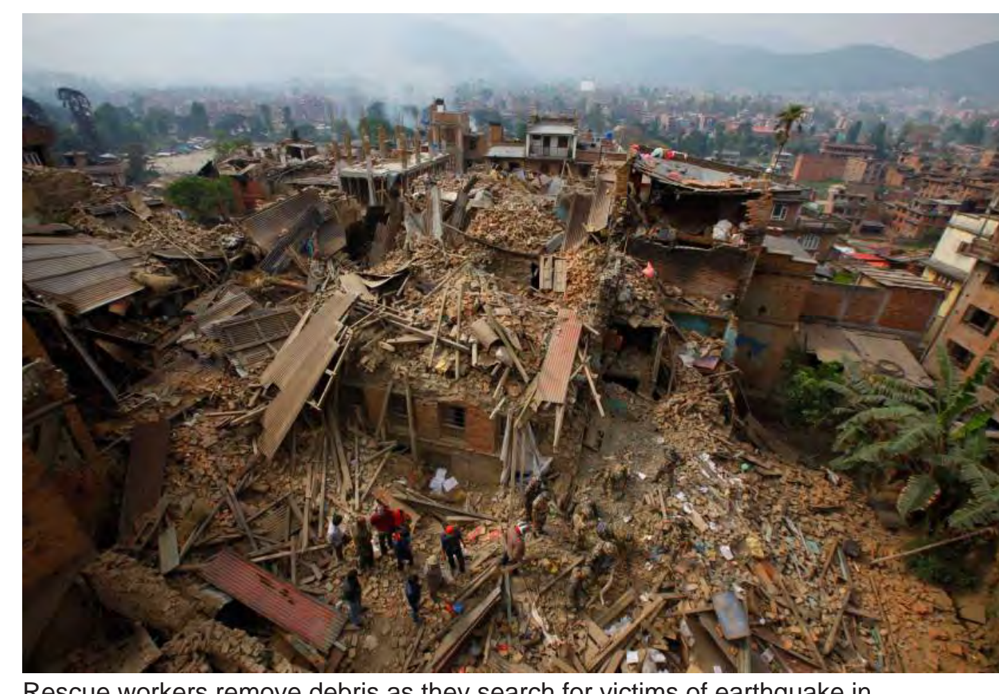
Rescue workers remove debris as they search for victims of earthquake in Bhaktapur near Kathmandu.