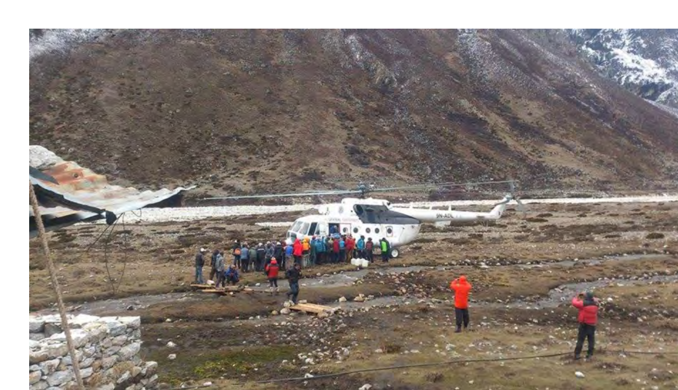
Mountaineers and Nepalese Sherpa guides evacuated from Everest Base Camp wait to board a rescue chopper to be flown to Lukla, in Pheriche, Nepal, Sunday, April 26, 2015. Mountaineers, guides and porters streamed from Mount Everest base camp on Sunday in the wake of a deadly earthquake-triggered avalanche that obliterated parts of the rocky village of nylon tents.