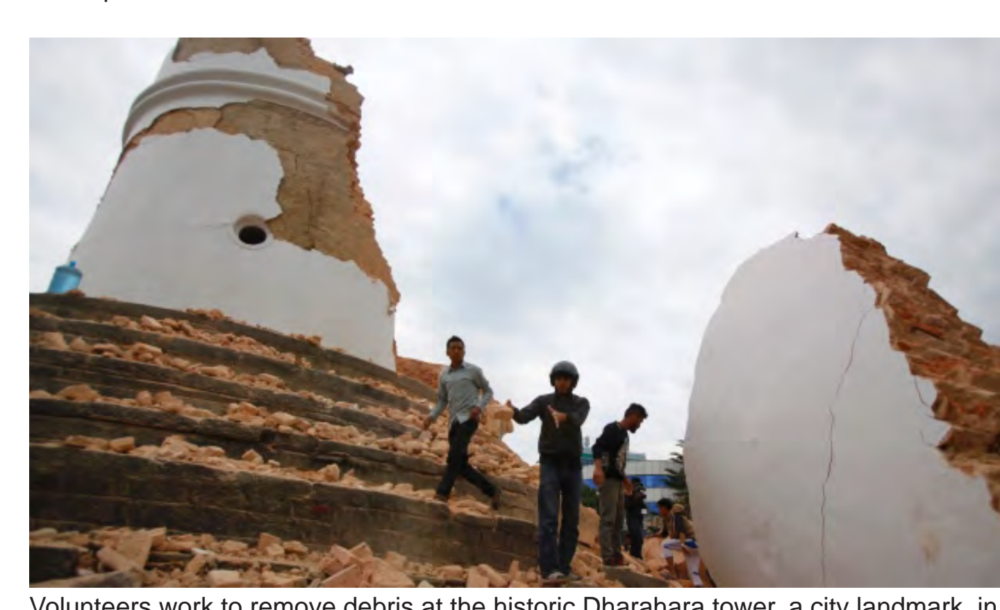
Volunteers work to remove debris at the historic Dharahara tower, a city landmark, in the wake of a 7.8-magnitude earthquake in Kathmandu, Nepal.