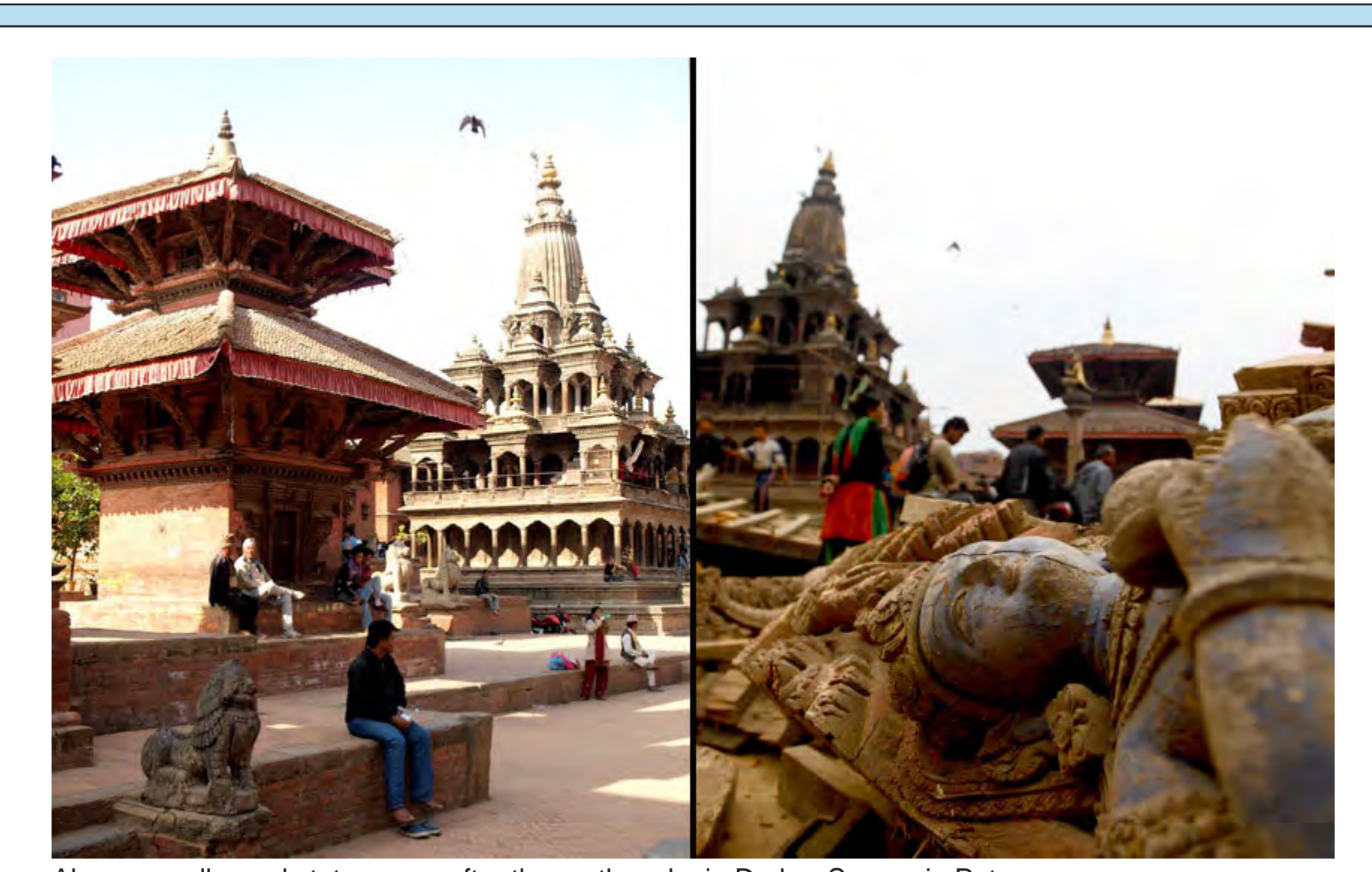
Above, a collapsed statue seen after the earthquake in Durbar Square in Patan.