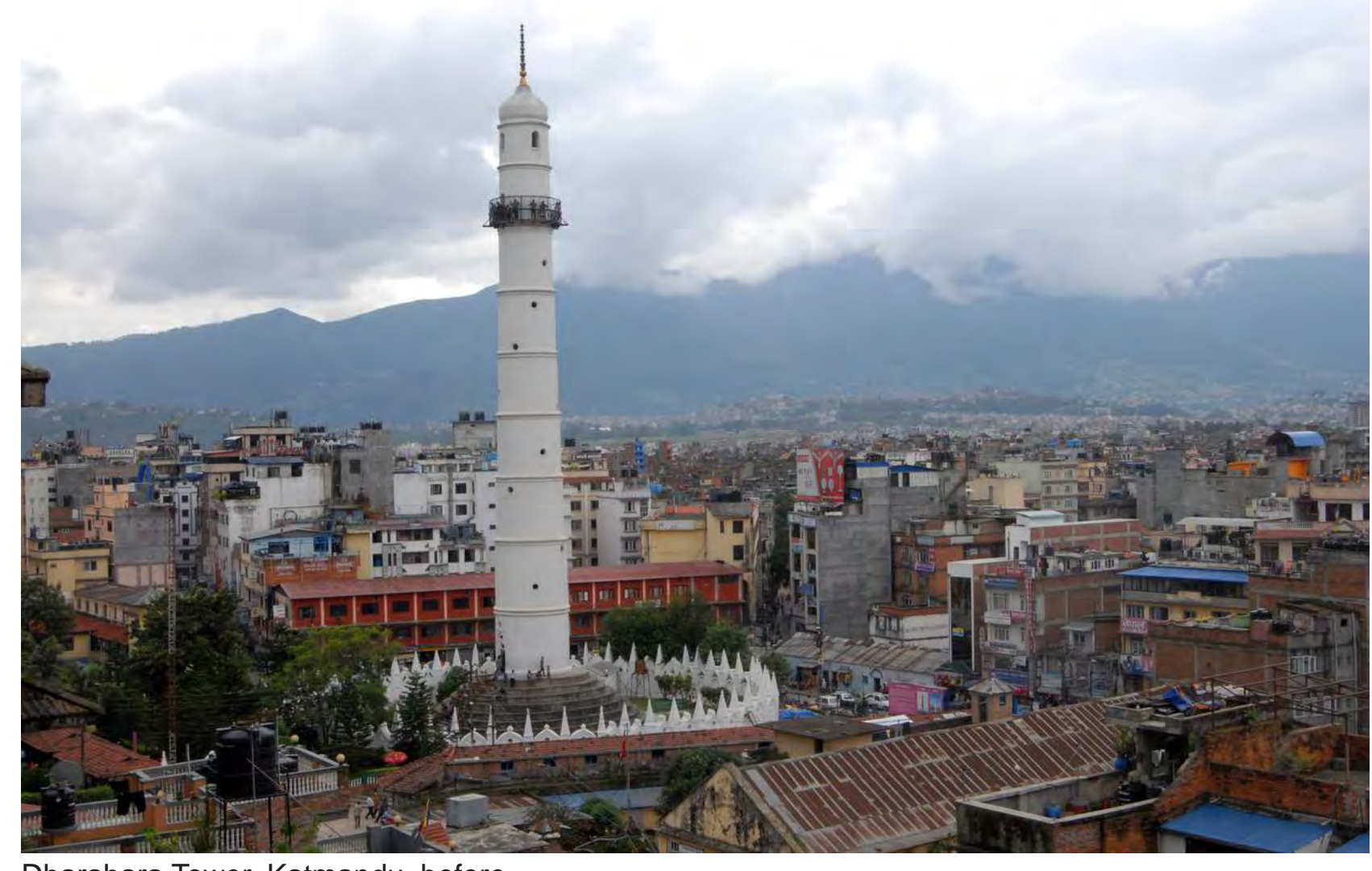
Dharahara Tower, Katmandu, before. A nine-story structure built in 1832 on orders from the queen. It was made of bricks more than a foot thick, and had recently been reopened to the public. Sightseers could climb a narrow spiral staircase to a viewing platform about 200 feet above the city.