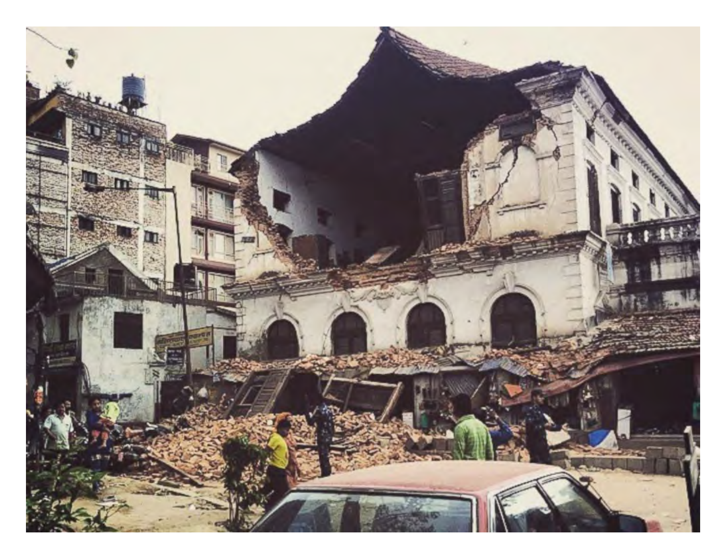
PHOTO: Damage in the city of Kathmandu after a massive earthquake strikes Nepal. - Instgram_NepalQuake, abcnews.go.com