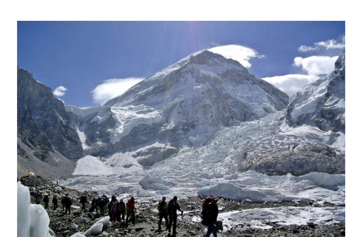
Climbers walk down a path from Mount Everest after expeditions were canceled following Saturday massive earthquake in Nepal. (Phurba Tenjing Sherpa/Reuters) www.washingtonpost.com