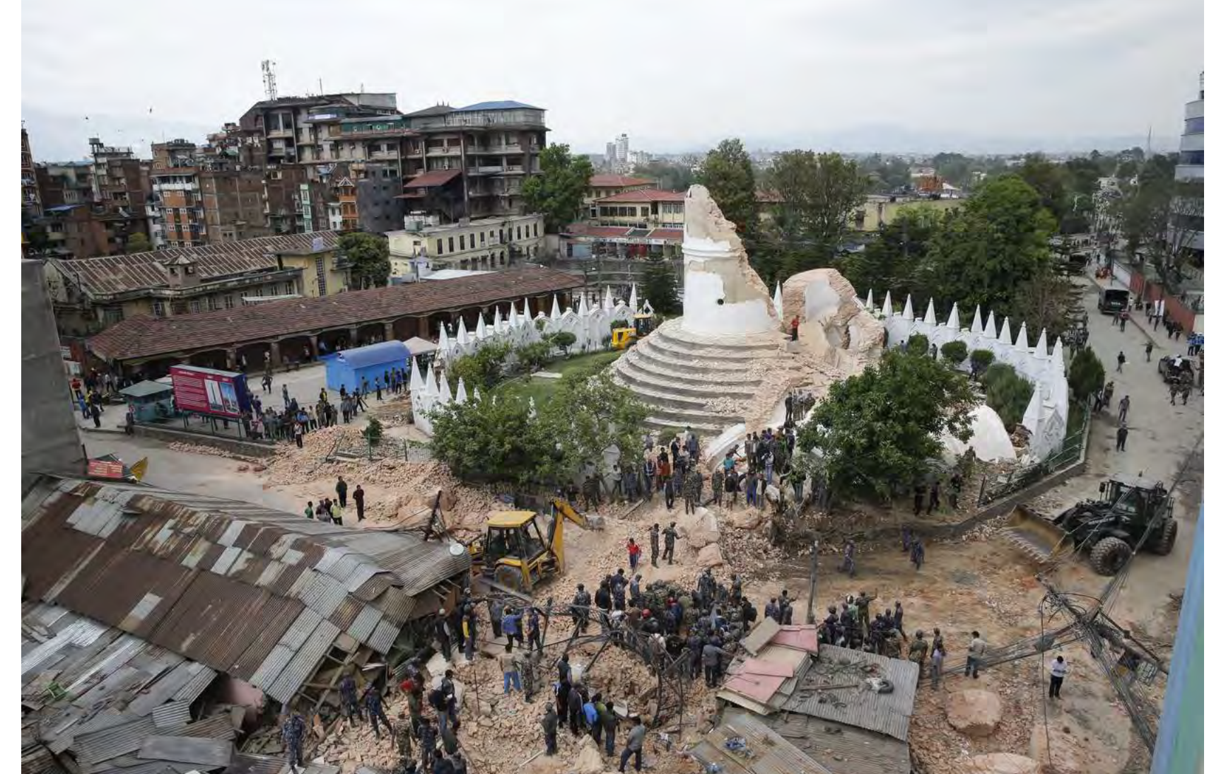
Dharahara Tower, after.