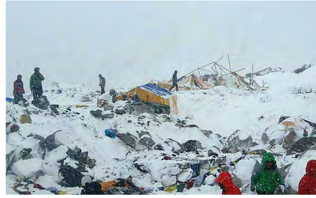
A large earthquake in Kathmandu has triggered an avalance on Mount Everes killing 18 people at base camp.