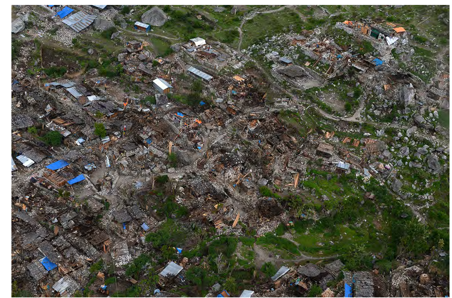
An aerial photo of earthquake-damaged houses at Kerauja village, in northern-central Gorkha District