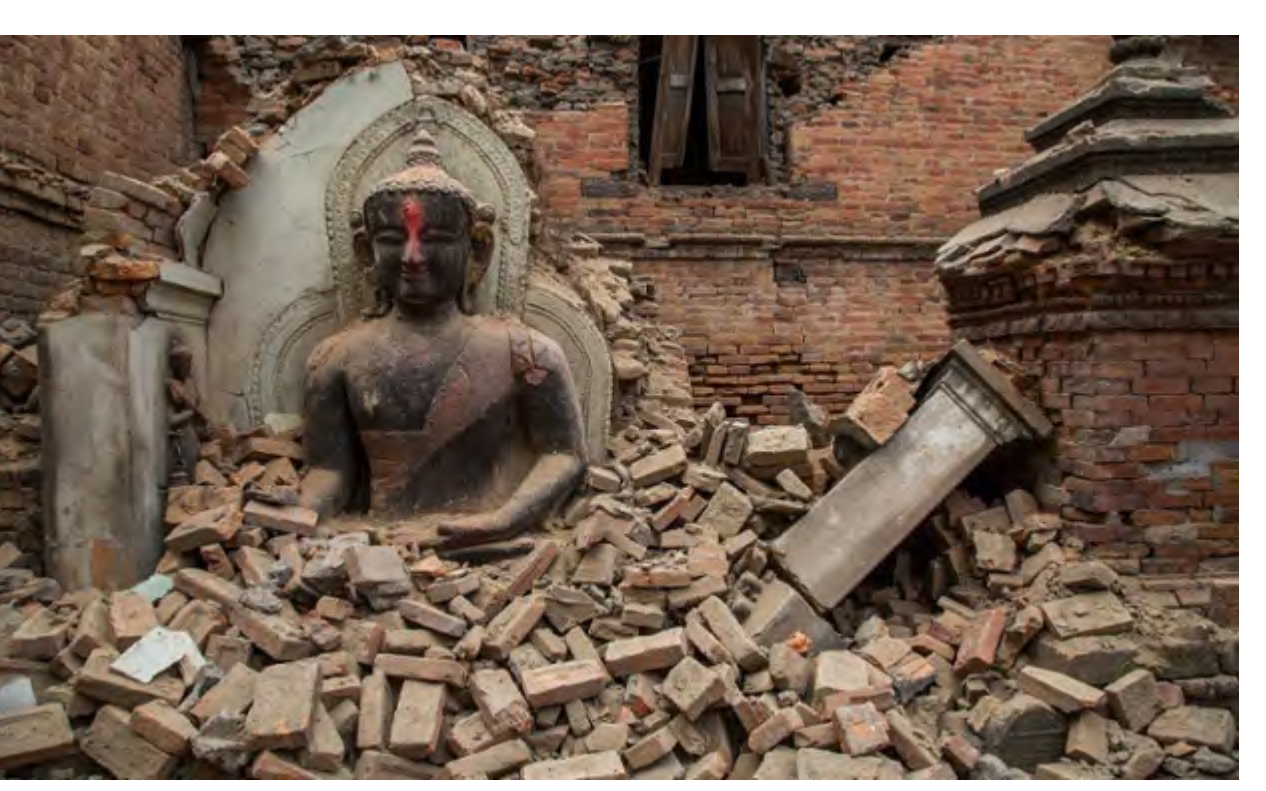
A Buddha statue is surrounded by debris from a collapsed temple in the UNESCO world heritage site of Bhaktapur on April 26, 2015 in Bhaktapur, Nepal.