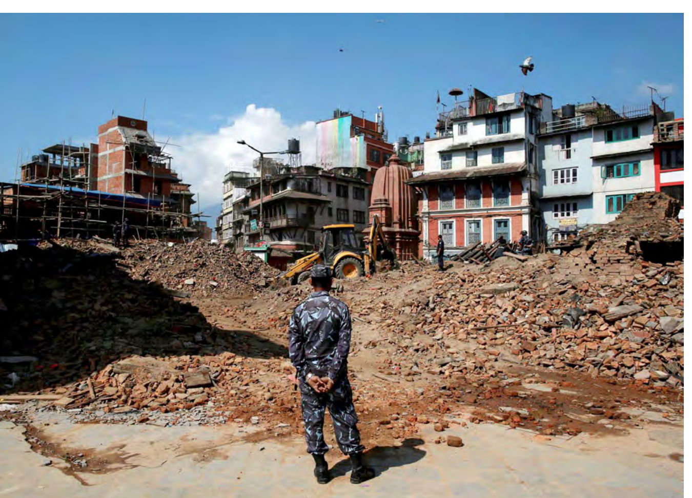
The Nepalese police looks on as an excavator is used to dig through rubble to search for bodies, in the aftermath of Saturday's earthquake in Kathmandu.