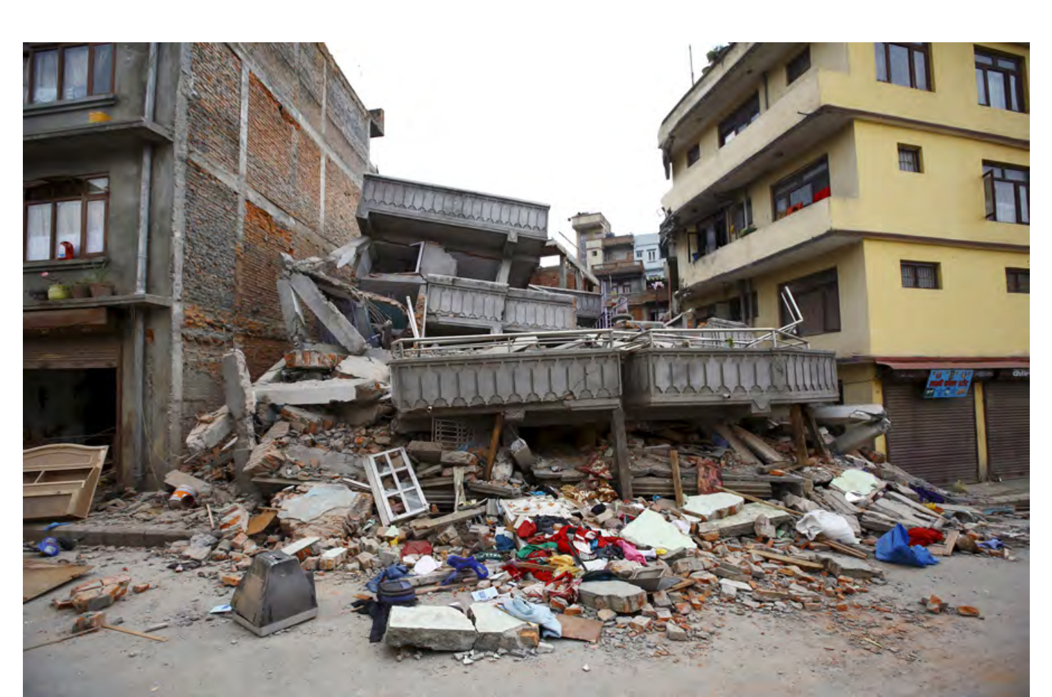
A collapsed building is pictured after an earthquake hit, in Kathmandu, Nepal.