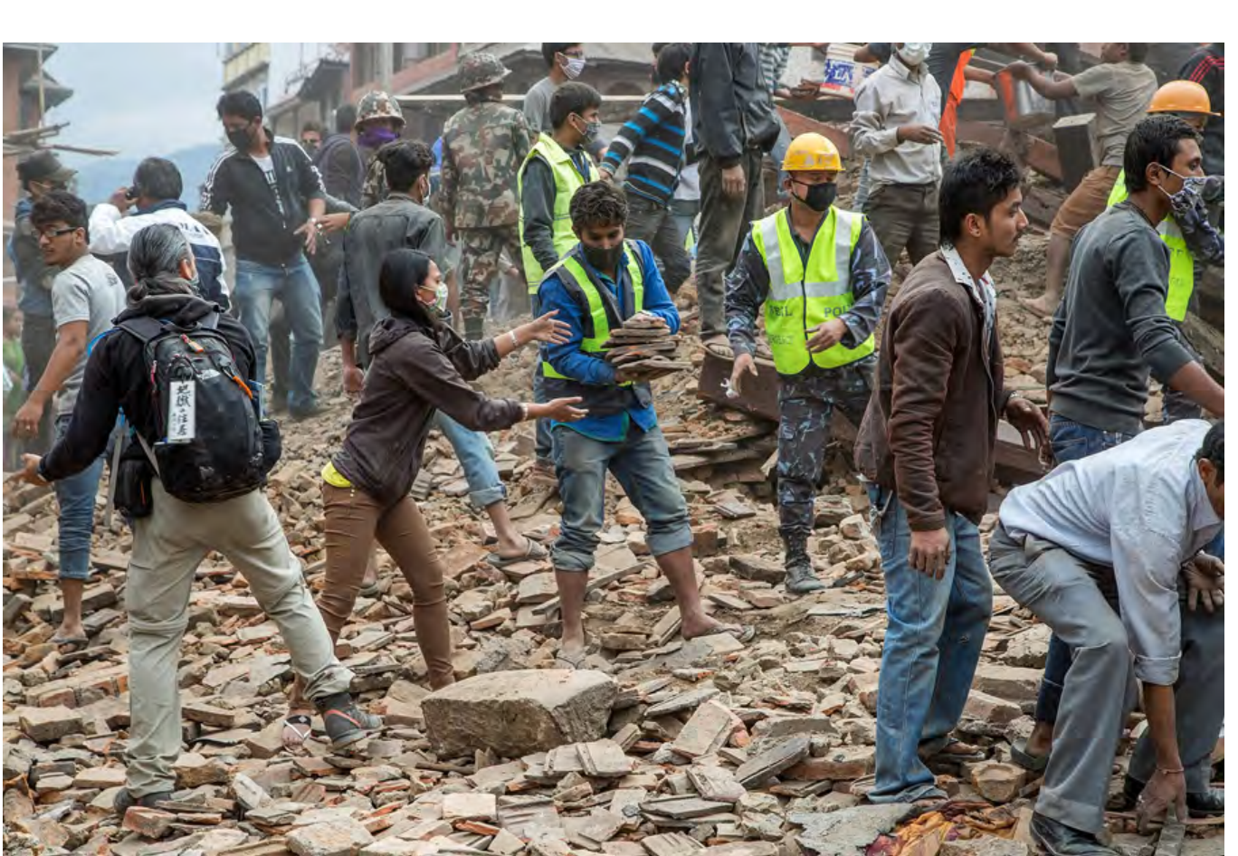
- Omar Havana/Getty, www.theatlantic.com