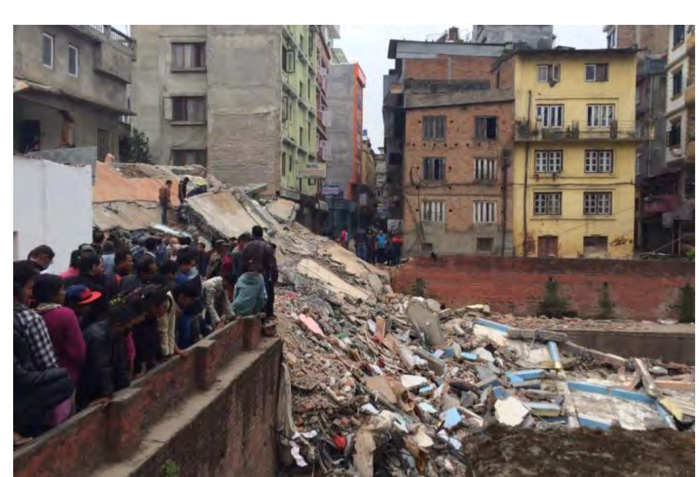
Collapsed building in Thamel, Kathmandu.