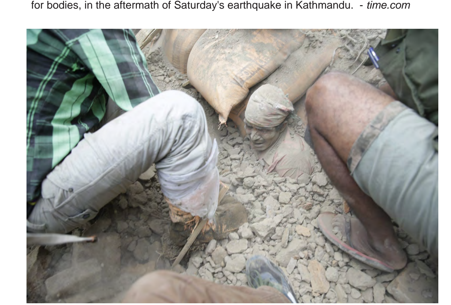
People try to free a man from the rubble of a destroyed building after an earthquake hit Nepal, in Kathmandu.