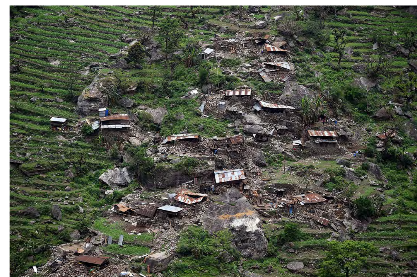
Earthquake-damaged houses in Gorkha District are seen from an Indian Army helicopter