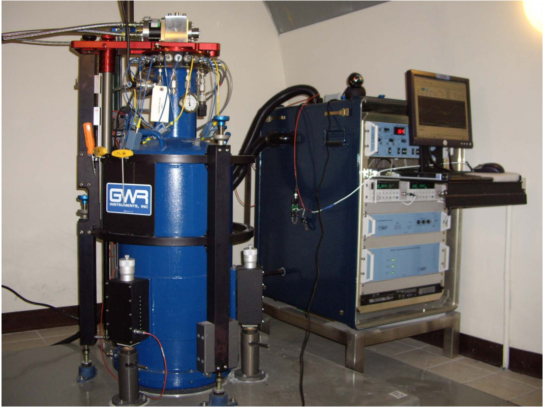
Fig. 1. A photograph of the superconducting gravimeter (No. 48) and its data acquisition system, installed at LOGG in Hsinchu Taiwan. The sensing unit (Fig. 2) is placed in the liquid helium dewar (the blue tank in this photograph) and operates at liquid helium temperatures ( \sim 4.2 K). (See the online edition for the color version of this figure.)

the superconducting gravimeters (No. 48) is shown in Fig. 1. A schematic view of the sensing unit of the superconducting gravimeter is shown in Fig. 2 (quoted from Ref. 1)).